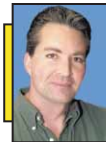
By Ned Hickson Siuslaw News

The latest trend is oxygen, which can now be purchased at a growing number of hip "Oxygen Bars" around the country. To prepare for your first venture, you must visualize the atmosphere of an