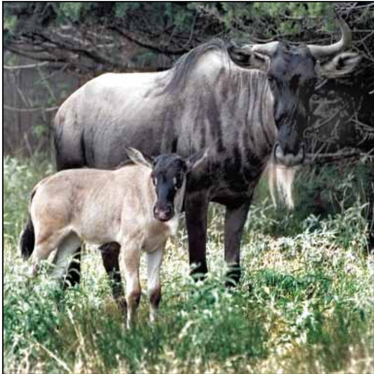
HELLO — Joining 16 other new calves just born at the Fossil Rim Wildlife Center outside Glen Rose, this baby Wildebeest will enjoy the concentrated conservation efforts of a facility dedicated to the protection of endangered and threatened species from all over the world.