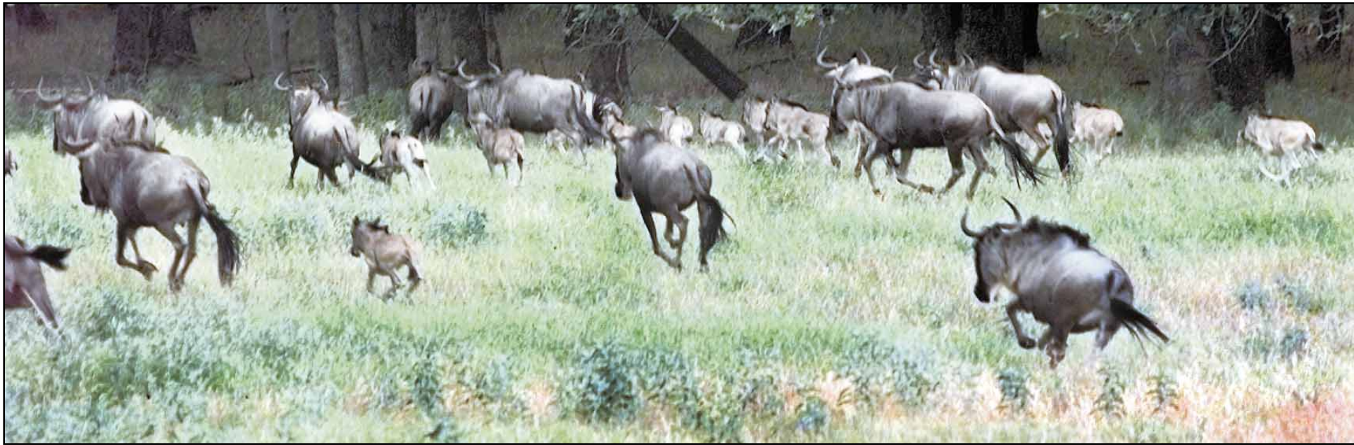
THE WILD SIDE OF THE WILDEBEEST is evident when the entire herd bolts in an instant. The herd of 47 at the Fossil Rim Wildlife Center in Glen Rose seems particularly on guard following the addition of 17 new calves to the herd.