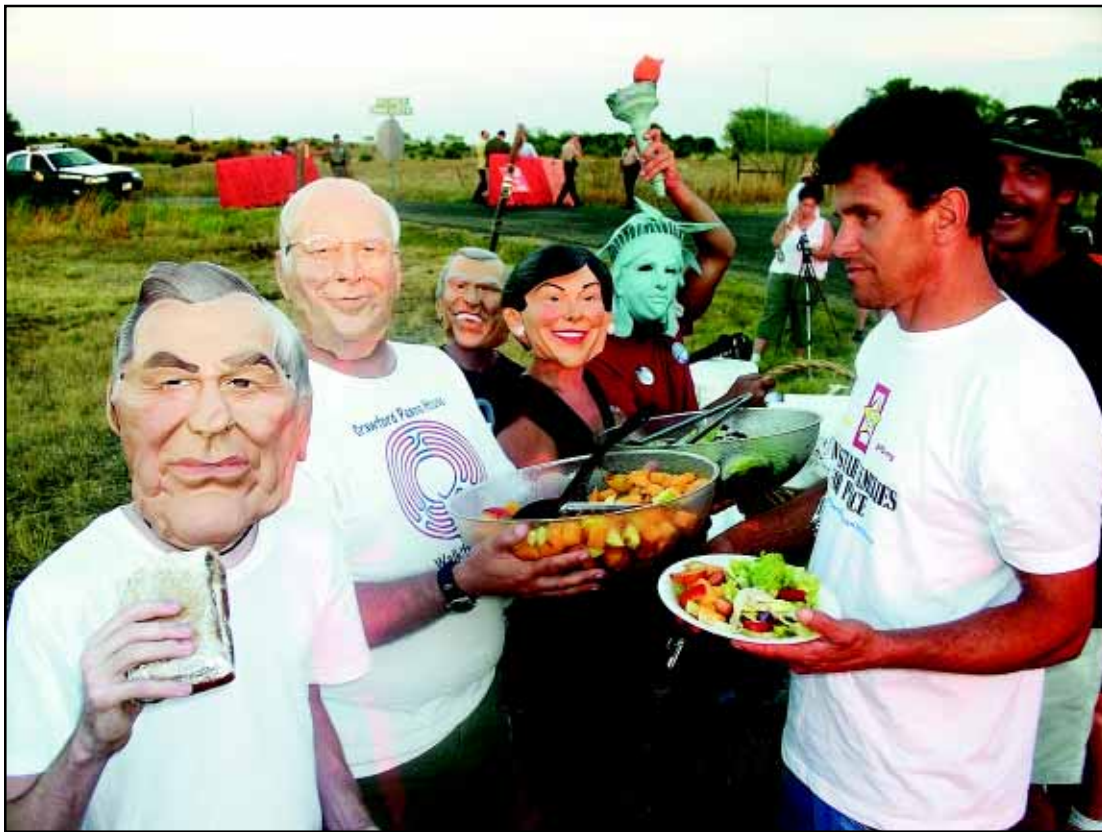
ACTIVISTS in Donald Rumsfeld, Dick Cheney, George W. Bush, Laura Bush, and Lady Liberty masks served the 30-plus peace picnickers Tuesday evening on the right-of-way near the former Camp Casey II just miles from the president's vacation ranch. An activist in a Condoleezza Rice (not pictured) was also present.