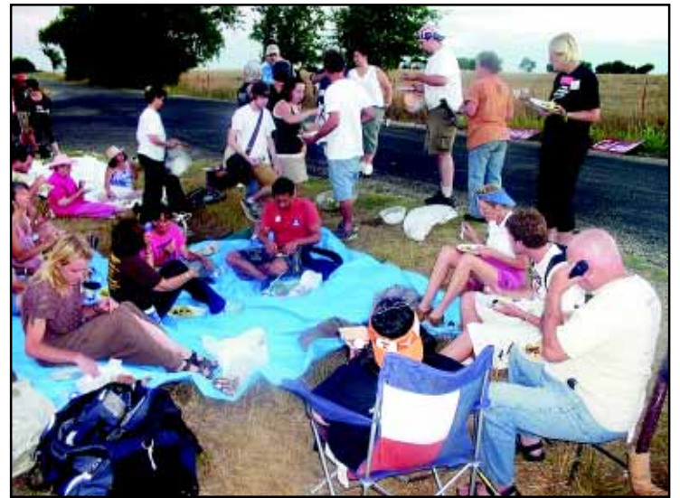
FULL RIGHT-OF-WAY — About 30 peace activists took part in the picnic at the corner of Prairie Chapel Road and Canaan Church Road last Tuesday evening.