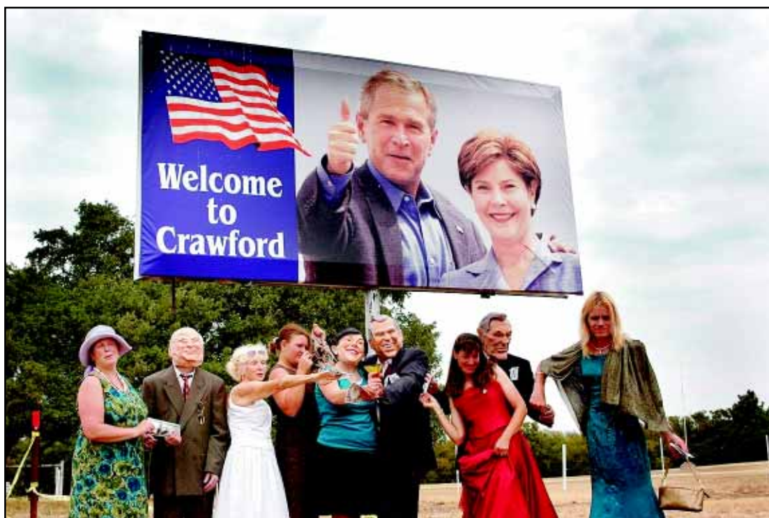
BILLIONAIRES FOR BUSH , a guerrilla theatre action mocking corporatists, was staged near the Bush ranch last Saturday afternoon.