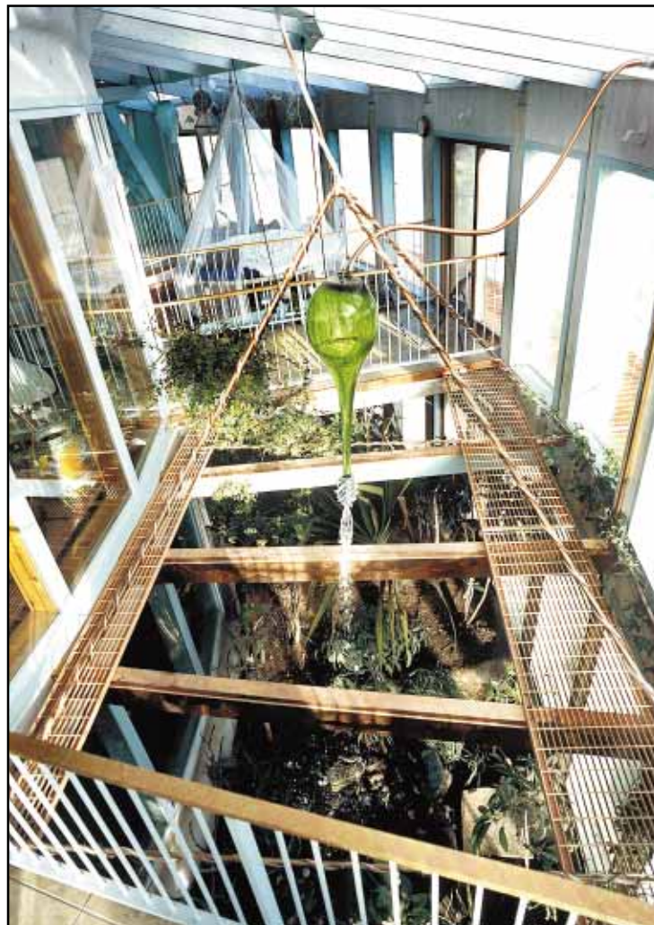
AN INDOOR RAINFOREST (pictured below) is a part of the water recycling system at Angel's Nest Retreat in Taos, N.M.

PLARR: Yeah, it is indepth. It's one of the unusual things because we actually do something. The rest of the — what I call psychobabble, the environmental movement, has basically failed in the last 40 years because they dance in circles