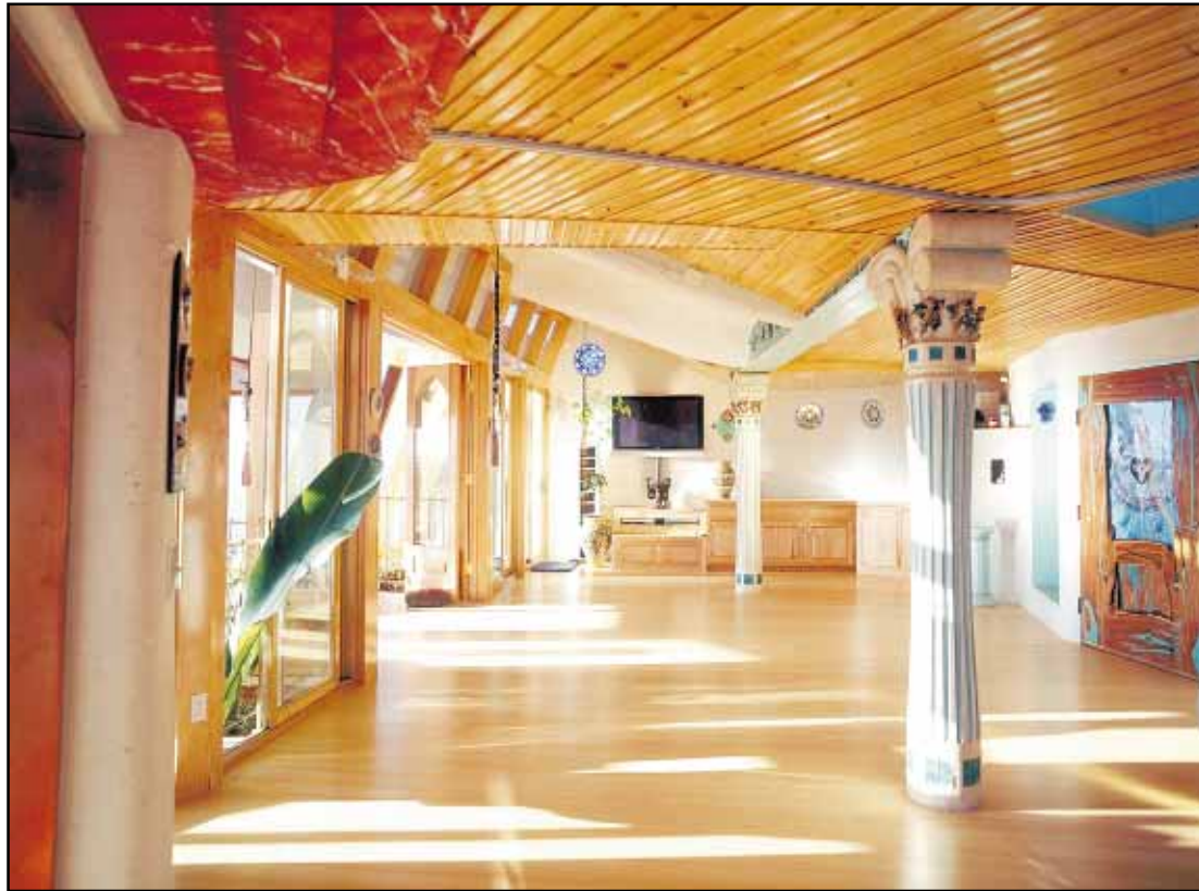
BUILDING MATERIALS used in the creation of Angel's Nest Retreat include adobe, but sustainable home designs can also incorporate waste materials such as foam cups and volcanic ash, according to co-founder Robert Plarr.

PLARR: Depending on the location and what your waste stream materials are, there could be foam cups; it could be one of the ingredients that you would use, like fly ash, volcanic ash, or anything like that. It's a blend. It's sort of like a concrete mix where you're blending all these materials together, and depending on your region — like in Scotland, they have a lot of granite, they call them crusher finds, available, and if you're in China or if you're in Arabia, there's a lot of sand, so it depends on your regional material. It's different mixes for