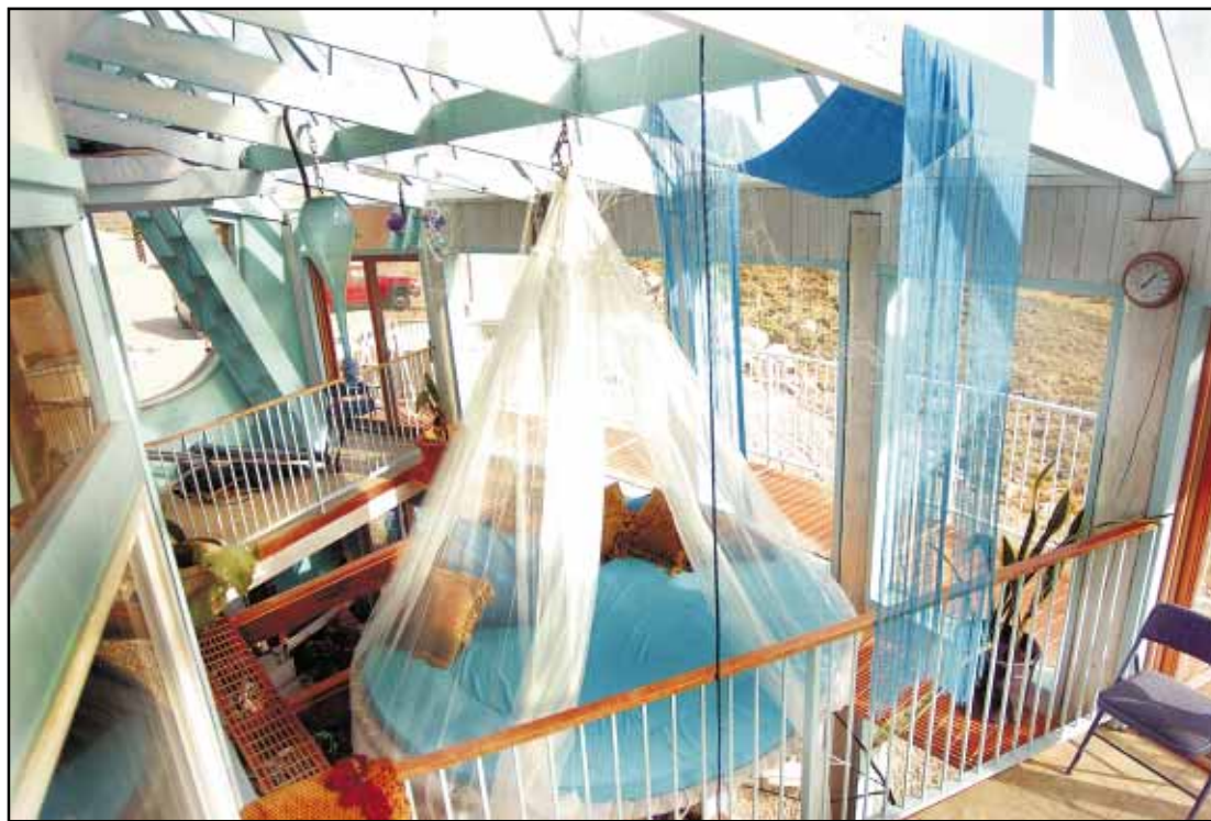
SPACIOUS LIVING QUARTERS are another main design feature of Angel's Nest Retreat in Taos, N.M.

PLARR: What's nice about this hydrogen is that you're storing excess energy. You can store a month's worth if you